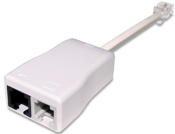
The Z-300TJ provides a DSL convenience jack for connecting a DSL modem

The Z-300TJ is a small in-line filter designed to expedite the service delivery and improve the performance of digital subscriber line (DSL) services. This model filters all telephone sets, facsimile machines, answering machines, etc. individually or in groups. It also provides a second convenience jack that is unfiltered for connecting DSL. This in-line DSL filter design electronically isolates the high-speed DSL data streams from the voice band plain old telephone service (POTS) equipment. This design effectively blocks the DSL, and other radio frequencies from 25 kilohertz to 30 Megahertz.