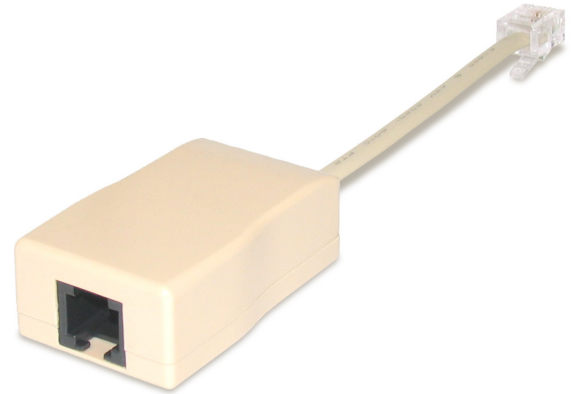
Z-230PJ In-Line xDSL over POTS Filter

The Z-230PJ is a small in-line filter designed to expedite the service delivery and improve the performance of digital subscriber line (DSL) and home phoneline network (HPN) services. This model filters all telephone sets, facsimile machines, answering machines, etc individually or in groups on line 1 only. Our in-line DSL filter design electronically isolates the high-speed DSL and HPN data streams from the voice band plain old telephone service (POTS). This design effectively blocks the DSL, and HPN up to 30 Megahertz.